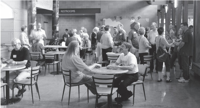
LEFT: Retirees join friends for lunch and a Kansas City Zoo tour in September.