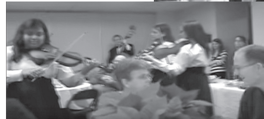
Shawnee Mission North High School Strolling Strings to entertain guests in December.