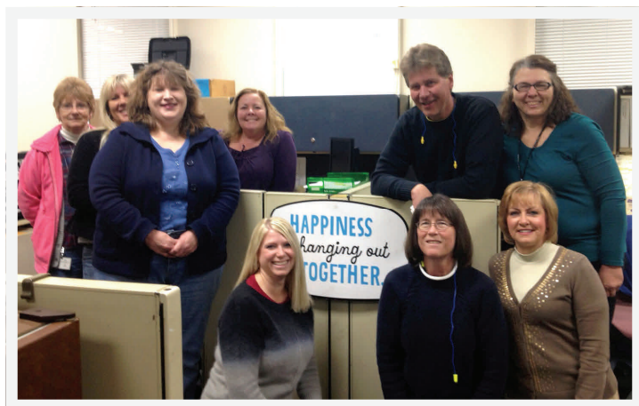
The coordinators are enjoying their new offices on the 3 rd floor. Their offices were moved to make room for the webtron equipment being moved from Lawrence as part of the KPC.

There have been a couple of changes since the November Connection article: First the jumbo packaging line is no longer moving to Leavenworth. Instead we are bringing sticker packaging line 7. In addition, the