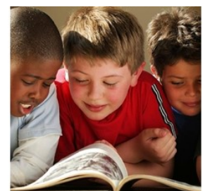
Many United Way programs are focused on education and helping children thrive.